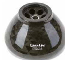
FIBERLite F65L-6x13.5 mL rotor